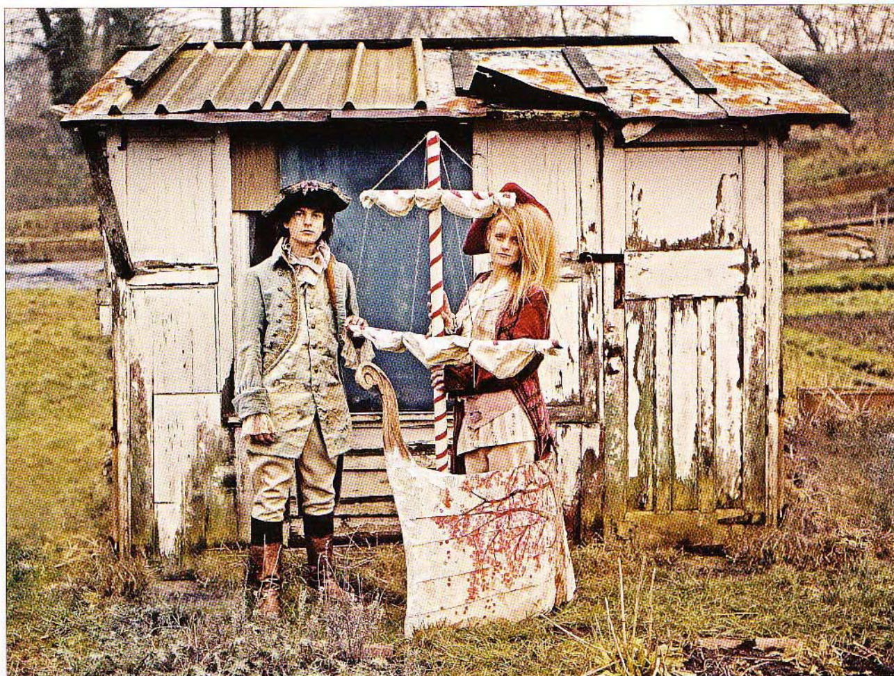
Left: Peculiar Fishing